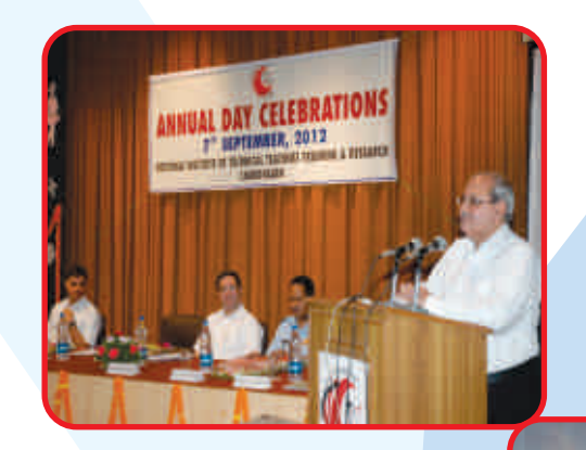
Annual Day Celebrations