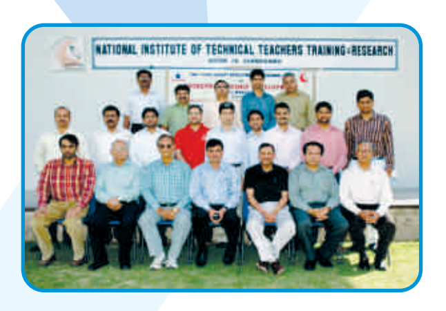
Participants of DST sponsored Faculty Development Programme