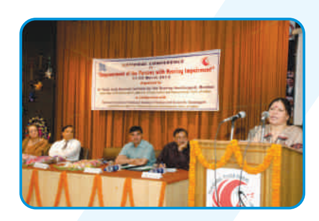
Hon'ble Smt. Geeta Bhukkal, Cabinet Minister, Govt. of Haryana delivering the inaugural address